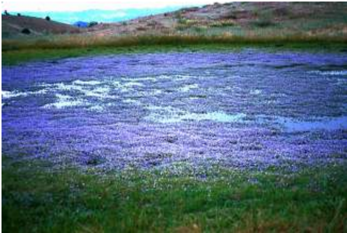
Figure 1. Examples of vegetation zones recognized by dominant species